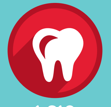
1,610 Personal hygiene items for military