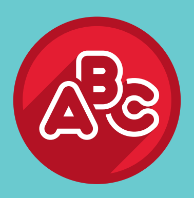
251 Backpacks filled for local students