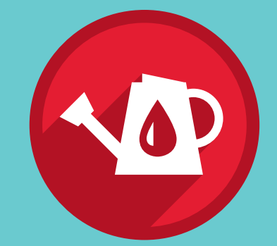
237 Gardening supplies donated