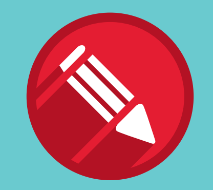
650 Handmade Cards for sick children