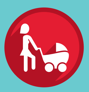
20,000 Diapers and wipes to local families