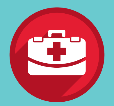
80 Team members donated blood