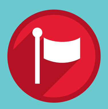
1,373 Flags placed on veterans graves