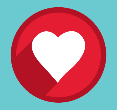
58 Random Acts of Kindness