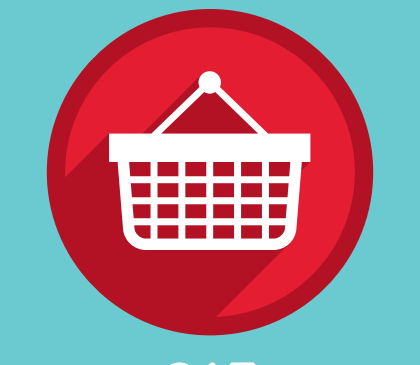
315 Supplies donated to Red Cross Fire Evacuation