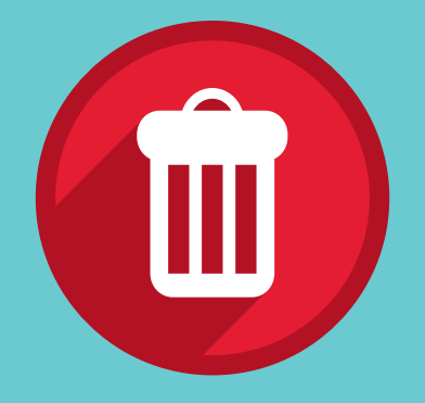
150 Gallons of trash cleaned off beaches